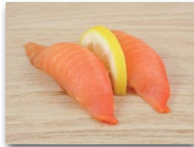
Smoked Salmon スモークサーモン $3.25