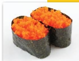
Masago (Smelt Roe) まさご $1.25