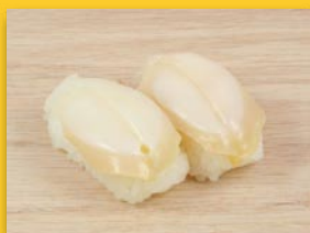
Raw Whelk 生つば貝 $3.25