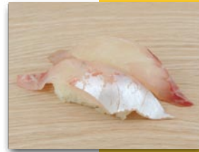
Sea Bass すずき $3.25