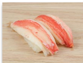
Snow Crab ずわい蟹 $4.25