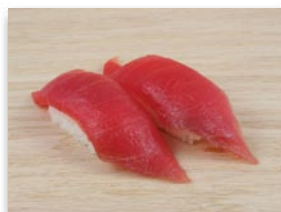
Tuna まぐろ $3.25