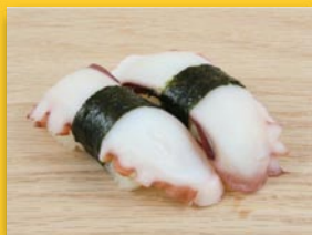
Boiled Octopus タコ $2.25