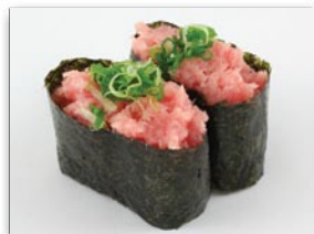
Negitoro ネギトロ軍艦 $2.25 Chopped tuna topped with green onion.