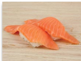
Salmon 鮭 $3.25