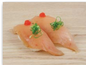
Albacore "White Tuna" びんちょうマグロ $3.25