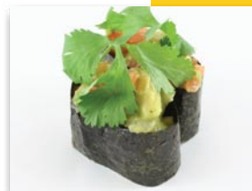
Salsa Gunkan サルサ軍艦 $1.25 Diced tomato, avocado, and onion topped with cilantro. (sesame oil)