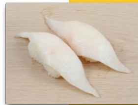
Escolar "Super White Tuna" スーパーホワイトツナ $3.25