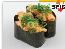
Spicy Yellowtail スパイシーはまち $4.25 Chopped yellowtail topped with green onion. (spicy mayo)