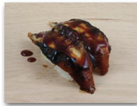
Eel うなぎ $3.25