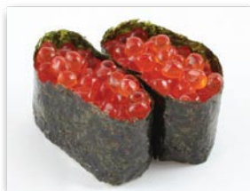
Salmon Roe いくら $4.25