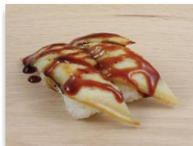
Conger Eel あなご $3.25