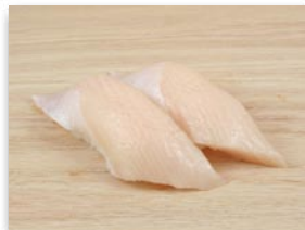
Fatty Yellowtail はまちトロ $4.25