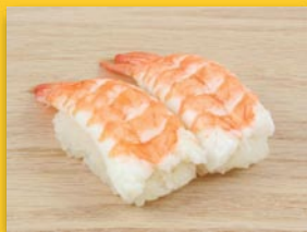
Boiled Shrimp エビ $2.25

Availability limited to supply. 数に限りがありますので、売り切れの際はご了承ください。