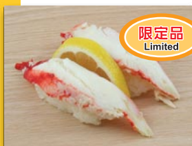
King Crab たらば蟹 $5.25