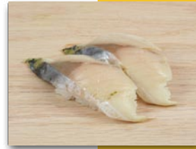
Mackerel さば $1.25