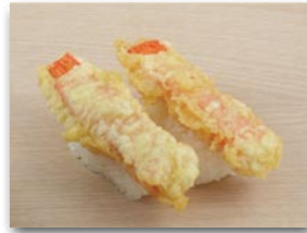
Imitation Crab Tempura カニカマ天ぷら $2.25