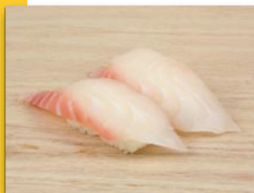
Tilapia いずみ鯛 $2.25