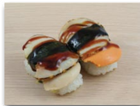
Steamed Scallop 蒸し帆立 $3.25