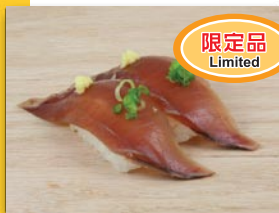
Bonito かつお $3.25