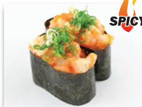
Spicy Scallop スパイシー帆立 $4.25 Chopped scallop, masago topped with green onion. (spicy mayo)