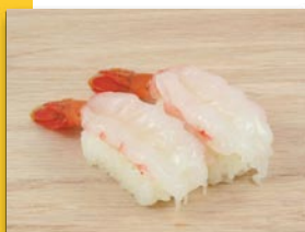
Sweet Shrimp 甘エビ Price/Size Varies