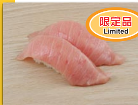
Fatty Tuna トロ Market price