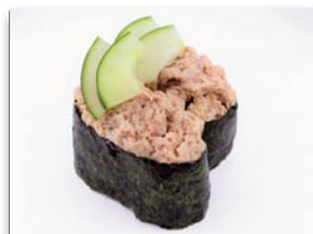
Tuna Salad ツナサラダ $2.25 Tuna salad with mayo and cucumber.