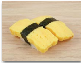
Cooked Egg たまご $1.25