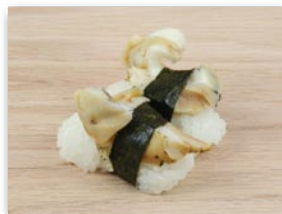
Boiled Whelk つぶ貝 $2.25