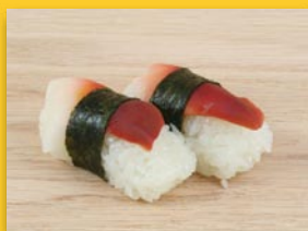
Surf Clam ホッキ貝 $1.25