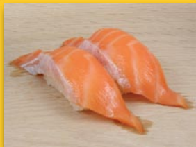
Fatty Salmon 鮭トロ $4.25