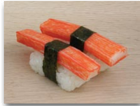
Imitation Crab カニカマ $1.25