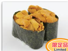
Sea Urchin うに Market Price