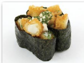
Calamari カラマリ $2.25 Calamari sticks, jalapeño and mayo topped w/ parsley.