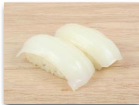
Squid イカ $2.25