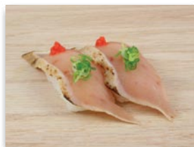
"Tataki"-seared Albacore びんちょう鮪のタタキ $3.25