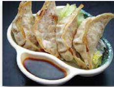
Gyoza 餃子 $3.50 Mouthwatering deep fried pork dumplings served with spicy ponzu sauce.