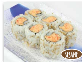
Station $3.50 (6pc.) Sushi Station original crab salad with masago.