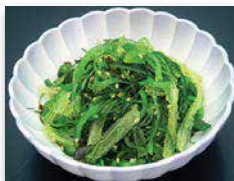
Seaweed Salad 海藻サラダ $3.50 Tasty seaweed with sesame oil and a hint of red pepper.