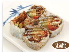
Spider $5.50 (4pc.) Soft shell crab tempura, cucumber, masago, and tempura crumbs drizzled with unagi sauce.