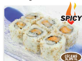
Spicy Scallop Roll $5.50 (6pc.) Chopped scallop & masago with spicy mayo.