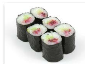
Ume $2.50 (6pc.) Cucumber and sour plum paste.