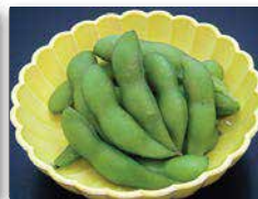
Edamame 枝豆 $2.50 Lightly salted boiled soy beans in pod.