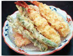
Tempura Mix $6.50 / Veggie $5.50 (Mix) Two fried shrimps, green beans, carrots, & sweet potatoes. (Veggie) Fried sweet potatoes, carrots, and green beans.