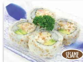
Paradise $8.00 (4pc.) Shrimp tempura, toasted coconut flakes, tempura crumbs & avocado