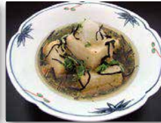
Agedashi Tofu 揚げ出し豆腐 $3.50 Fried tofu served in bonito broth with green onions, daikon, and dried seaweed.