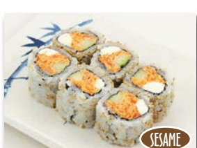
3 C $3.50 (6pc.) Crab salad, cream cheese and cucumber.