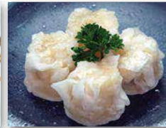
Shrimp Shumai 海老シューマイ $3.50 Steaming hot shrimp dumplings served with hot mustard on the side.