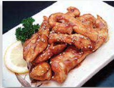
Chicken Teriyaki 照り焼きチキン $5.99 Delicious sliced broiled chicken breast with sesame and teriyaki sauce.