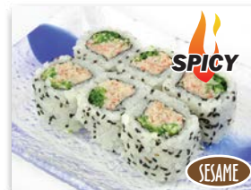
Winter $3.50 (6pc.) Black pepper crab salad with green onion.