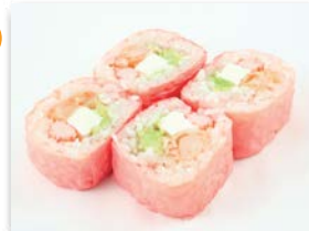
Dream $7.00 (4pc.) Cream cheese, cucumber, shrimp tempura, imit. crab rolled w/ soy paper.