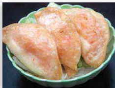
Station Rangoon ステーション・ラングーン $2.50 Fried rangoon filled with station crab salad, masago and cream cheese.