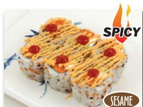
SOL $3.50 (6pc.) Carrots, cucumber, cream cheese, tempura crumbs, spicy mayo, chili paste and spicy sesame