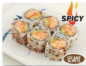
Fire Station $3.50 (6pc.) Spicy crab salad, tempura crumbs and spicy sesame.