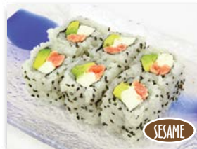
Philadelphia $3.50 (6pc.) Cream cheese, avocado and salmon.