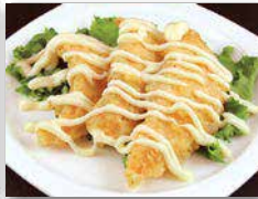
Honey Salmon ハニーサーモン $4.50 Salmon tempura drizzled with signature honey mayo sauce.