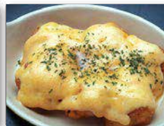
Station Shrimp ステーション・シュリンプ $5.99 Deep fried battered shrimp covered in Sushi Station's original golden style sauce.