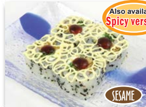
Hanako $4.50 (4pc.) Cream cheese, tempura crumbs, imit. crab, green onion topped with mayo & teriyaki sauce.