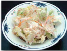
Salad サラダ $2.99 Fresh crisp lettuce, carrots and cabbage served with sesame dressing.