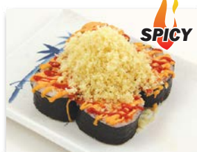
Fire Crunch $7.00 (4pc.) Crab salad, shrimp tempura, masago topped with spicy mayo, chili paste and tempura crumbs.