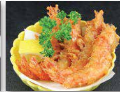
Soft Shell Shrimp ソフトシェル・シュリンプ $4.50 Deep fried crunchy Vietnamese shrimp in seasoned batter.