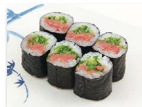
Negitoro Roll $3.50 (6pc.) Minced tuna with green onion.