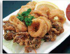
Fried Calamari イカの唐揚げ $6.25 Classic fried calamari season battered, served with cocktail sauce.