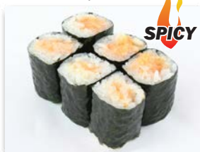
Spicy Salmon $2.50 (6pc.) Minced salmon with spicy mayo.