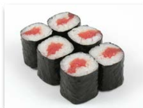
Tuna $3.50 (6pc.) Fresh tuna.