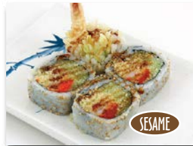
Shrimp Tempura $4.50 (4pc.) Shrimp tempura, cucumber, masago and tempura crumbs drizzled with unagi sauce.