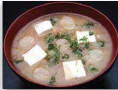
Miso Soup 味噌汁 $1.50 Miso soup with tofu, seaweed, and green onions.