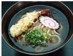
Udon うどん Large $6.50 / Small $4.50 Thick rice noodles in broth soup. Served with green onion, fishcake, and shrimp tempura.