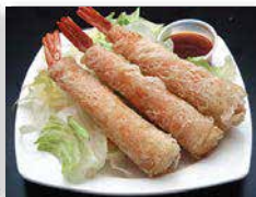
Shrimp Crispers シュリンプ・クリスパー $4.99 Crunchy deep fried shrimp made with lightly seasoned rice flour wrap. Served with spicy ponzu sauce.