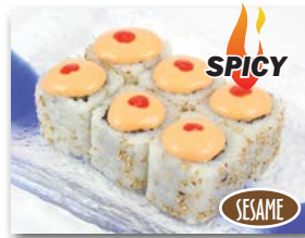
San Diego $5.25 (6pc.) Spicy salmon, tempura crumbs, and cucumber, topped with spicy mayo and chili paste.