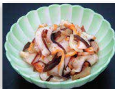
Smoked Squid Salad イカ山菜 $3.50 Smoked squid salad medley with Japanese vegetables.