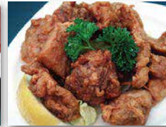
Fried Chicken 鳥の唐揚げ $4.99 Hand battered seasoned chicken chunks fried to perfection.