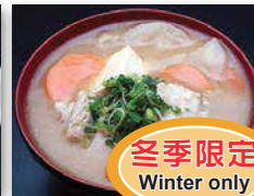
Tonjiru Soup トン汁 $4.50 Miso based soup with daikon, carrots, pork belly, tofu, green onion, and assorted Japanese vegetables.