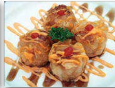
Fried Shumai 揚げシューマイ $4.50 Delicious deep fried shrimp dumplings drizzled with tonkatsu sauce, spicy mayo and chili paste.