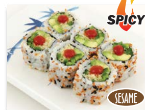
Spicy Garden Crunch $3.50 (6pc.) Avocado, jalapeño, tempura crumbs, chili paste and spicy sesame.