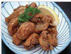
Fried Mushrooms マッシュルームの唐揚げ $4.99 Fresh bell mushrooms. Seasoned, battered and fried to order. Served with house made cucumber sauce.