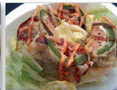
Volcano Poppers ボルケーノ・ポップス $5.99 Tempura fried jalapeño stuffed w/ cream cheese & spicy tuna drizzled w/ spicy mayo & teriyaki sauce.