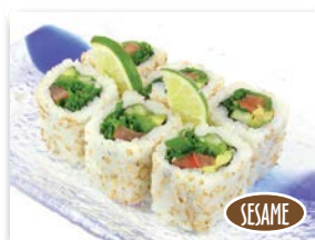
Fiesta $3.50 (6pc.) Jalapeño, cucumber, avocado, tomato, lime and cilantro.

Upon request, we can remove certain ingredients.