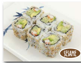
California $3.50 (6pc.) Imitation crab, avocado and cucumber.