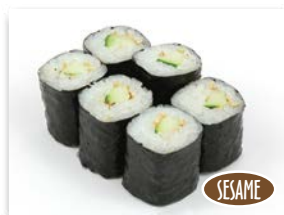
Cucumber $2.50 (6pc.) Fresh cucumber with sesame.