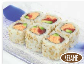
Bostation $6.50 (6pc.) Tuna, avocado and crab salad w/ masago.