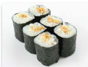
Natto $2.50 (6pc.) Japanese fermented soy bean.