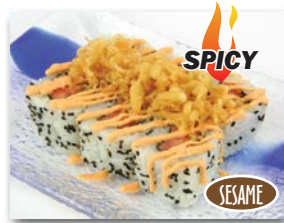
Phoenix $6.50 (6pc.) Spicy tuna, tempura crumbs and masago w/ spicy mayo.

Upon request, we can remove certain ingredients.