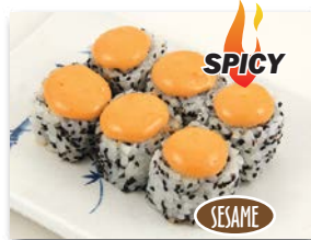
Spicy Tuna $6.50 (6pc.) Minced tuna with spicy mayo.