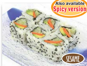
Vegetable $3.50 (6pc.) Avocado, cucumber and carrot.