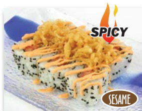
Phoenix $6.00 (6pc.) Spicy tuna, and tempura crumbs w/ spicy mayo.

Upon request, we can remove certain ingredients.