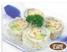
Paradise $8.00 (4pc.) Shrimp tempura, toasted coconut flakes, tempura crumbs & avocado

*The Illinois Department of Public Health advises that eating raw or undercooked meat, poultry, eggs or seafood poses a health risk to everyone, especially to the elderly, children under age 4, pregnant women, and other susceptible individuals with compromised immune systems.