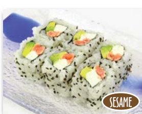
Philadelphia $4.00 (6pc.) Cream cheese, avocado and salmon.