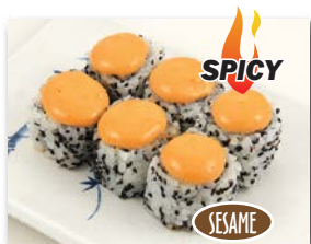
Spicy Tuna $6.00 (6pc.) Minced tuna with spicy mayo.