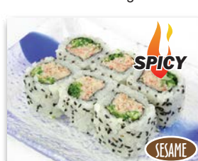
Winter $4.00 (6pc.) Black pepper crab salad with green onion.