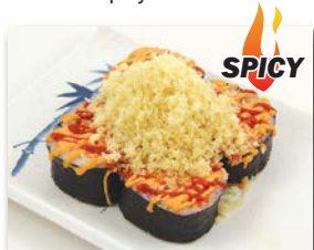
Fire Crunch $8.00 (4pc.) Crab salad, shrimp tempura topped with spicy mayo, chili paste and tempura crumbs.