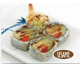
Shrimp Tempura $5.00 (4pc.) Shrimp tempura, cucumber and tempura crumbs drizzled with unagi sauce.