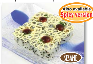
Hanako $6.00 (4pc.) Cream cheese, tempura crumbs, imit. crab, green onion topped with mayo & teriyaki sauce.