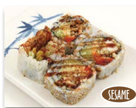
Spider $6.00 (4pc.) Soft shell crab tempura, cucumber and tempura crumbs drizzled with unagi sauce.