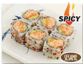
Fire Station $4.00 (6pc.) Spicy crab salad, tempura crumbs and spicy sesame.