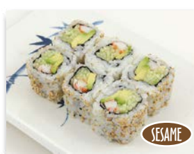
California $4.00 (6pc.) Imitation crab, avocado and cucumber.