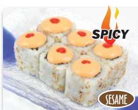
San Diego $6.00 (6pc.) Spicy salmon, tempura crumbs and cucumber, topped with spicy mayo and chili paste.