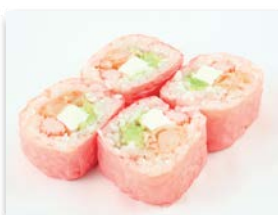
Dream $8.00 (4pc.) Cream cheese, cucumber, shrimp tempura, imit. crab rolled w/ soy paper.