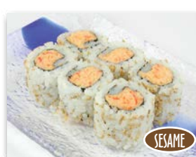
Station $4.00 (6pc.) Sushi Station original crab salad